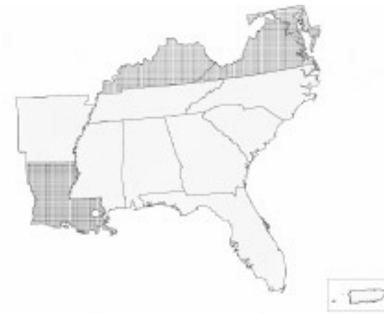
SERCH region: DC, KY, MD and VA [shared with Broker/Facilitators], LA [Score], and AL, AK, FL, GA, MS, NC, PR, SC/VI, TN